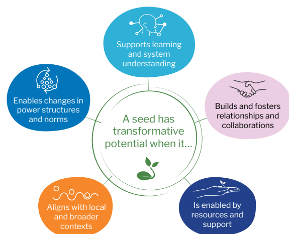
Fig 1 Framework: Seeds transformative potential

The initiative has contributed to several dimensions recognised as enabling transformative potential. However, this is manifested to varying degrees as their work focuses more on some dimensions than others. Importantly, the five dimensions of transformative potential we use in this analysis are not static, and actions that fall within one dimension can support others and even be prerequisites for them. This is reflected in how various factors can drive transformations 13,14,15-17 . Through the Trans-Harmony Farms project, the Initiative of Trans with A Mission focuses on challenging existing power structures and norms while fostering and building the relationships and collaborations needed to support the LGBTQIA+ farming community. The following sections will explore how the initiative takes action in an often hostile and restrictive context and how its activities might contribute (or not) to the five dimensions of transformative potential.